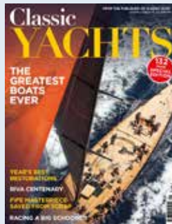
ANNUAL CLASSIC YACHTS PUBLICATION