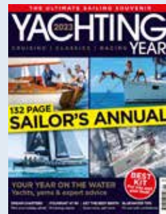
ANNUAL YACHTING YEAR PUBLICATION