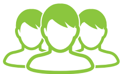
FIRST PARTY DATA