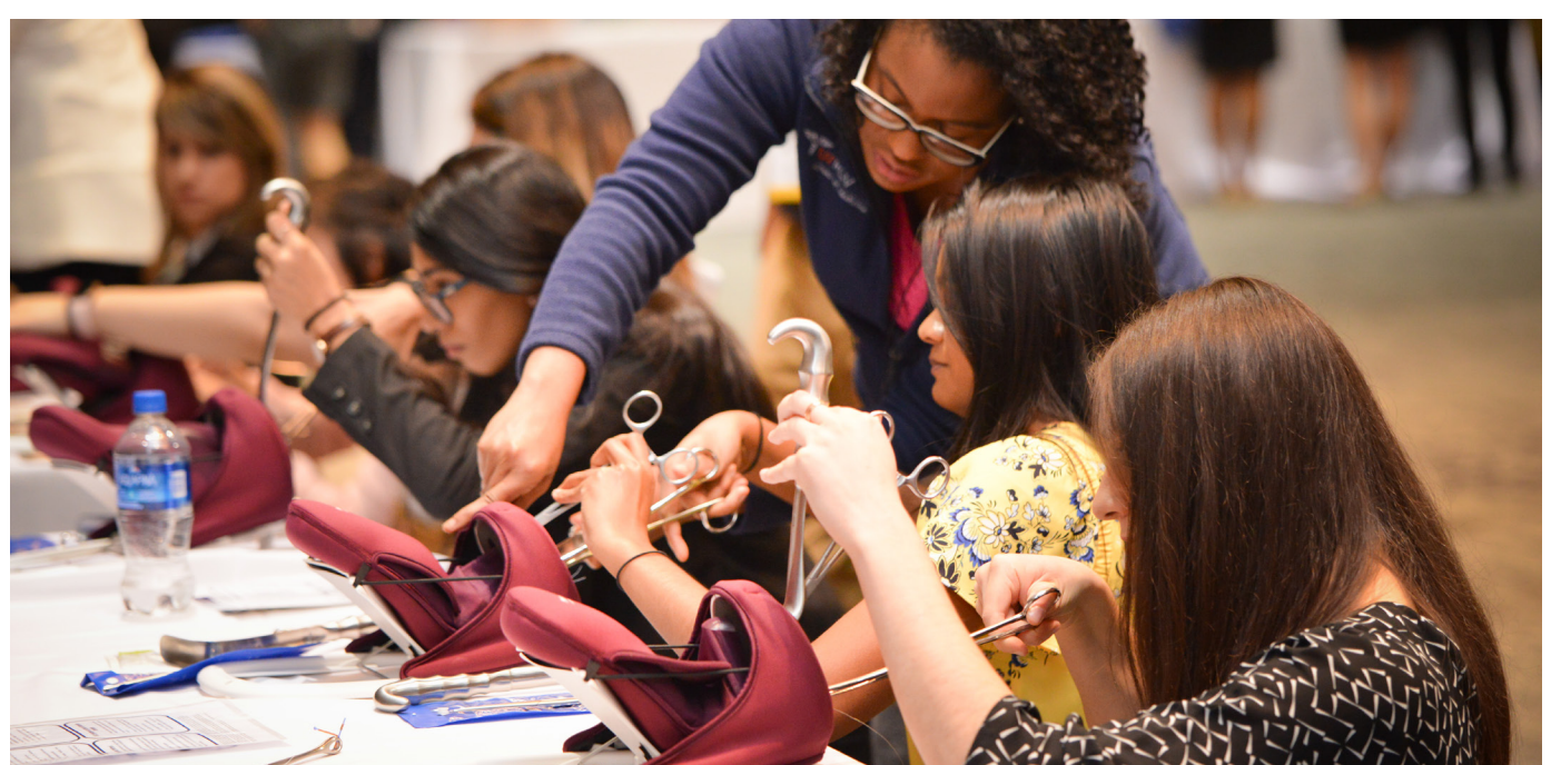
Hands-on training at the District XI Annual District Meeting.

Held every October, this program features lectures and learning opportunities for Junior Fellows of ACOG District III (Delaware, New Jersey, Pennsylvania, and the Dominican Republic). Support will be recognized on signage at the registration table.