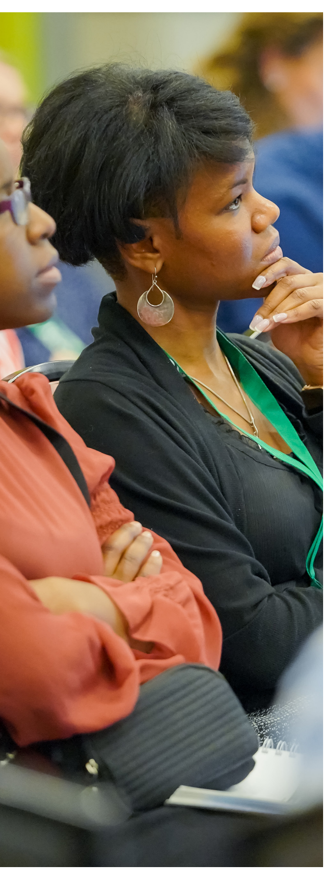
Annual meeting audience members watching a session.