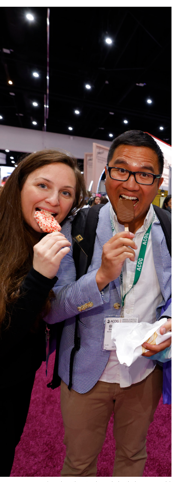
Annual meeting attendees enjoying the ice cream social.