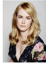
Abigail Hawk Actress