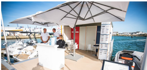
An example of a 7.5m x 4.5m floating deck with a 4m x 4m soft-sided marquee

Please confirm your marquee requirements on the Application Form and provide a draft layout of your stand. No flooring is included due to weight capacity on water. All marquees are subject to availability and will be confirmed at the time of booking.