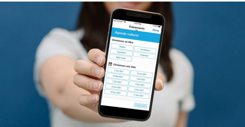
maBULCO's events feature

"At UvA, approximately 25% of our patrons still need to access physical resources," says Heesakkers. "Although we do send students emails to let them know their books are ready to be collected, we've found that students don't always engage with the emails we send out." The library was also eager to use the app to make key library services, such as its BookSwap marketplace and finding study spaces, more accessible to students on the go.