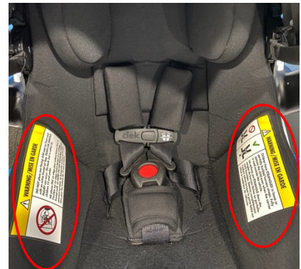
Warning labels affixed to the fabric cover (may also be affixed to the headrest)

When contacting Clek, owners should have their car seat's serial number and "manufactured on" date available. Owners will also be required to provide a photo showing the defective label to receive a remedy kit.