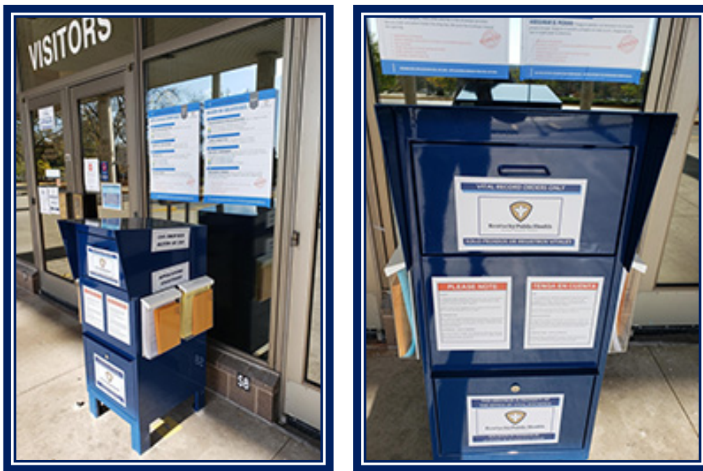
Fig. 5 – Shows the OVS Drop Box located at the OVS office.

A Drop Box is located directly outside the Visitor's Entrance of the OVS office. This box may be used to drop off orders for birth, death, stillbirth, and marriage/divorce certificates when the office is closed. A supply of envelopes and application forms are usually stocked in trays attached to the drop box for customers' use. Please note that applications must be fully completed and accompanied by a check or money order made payable to the Kentucky State Treasurer for the correct fee for the order to be accepted. The completed applications are collected daily. Requests received from the Drop Box may take up to thirty (30) working days to process. Further instructions pertaining to drop off orders are printed on the box itself.