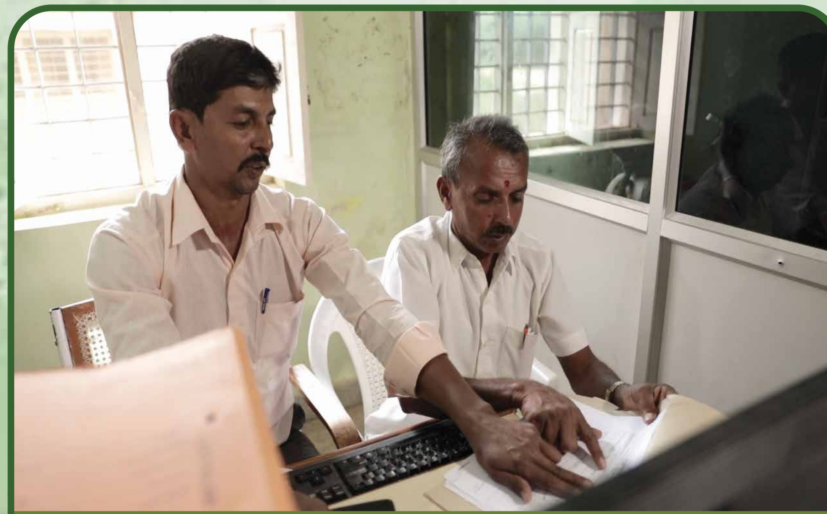
Supporting 25,000 concurrent users