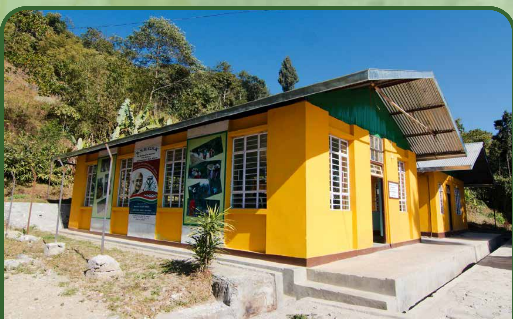
99% expenditure through eFMS