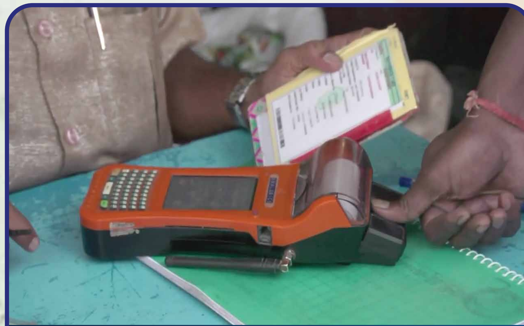
Timely generation of wage payments