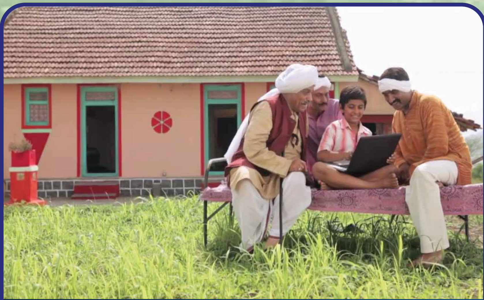
NeFMS in 27 States & 3 UTs