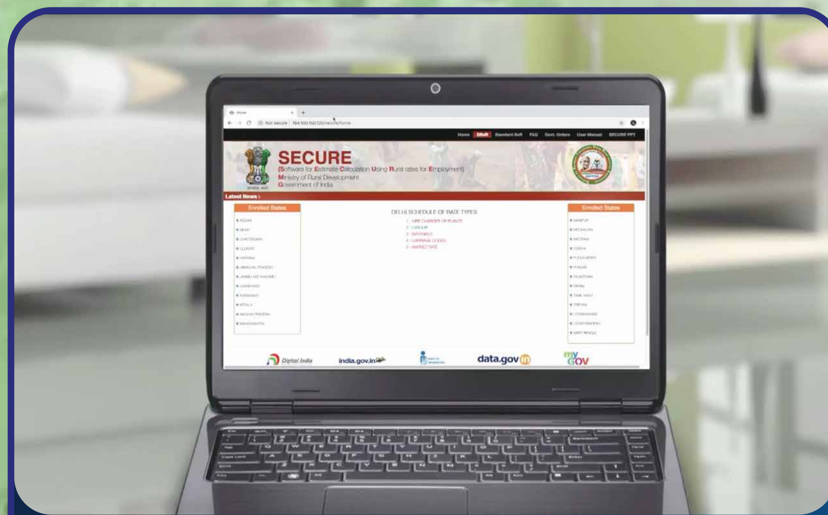
Online estimate creation through SECURE