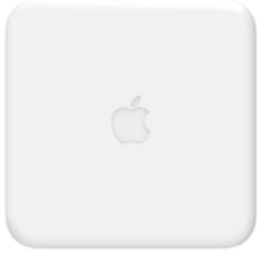
The exterior of the Apple Watch carrying case is composed of 50 percent post-consumer recycled polycarbonate.