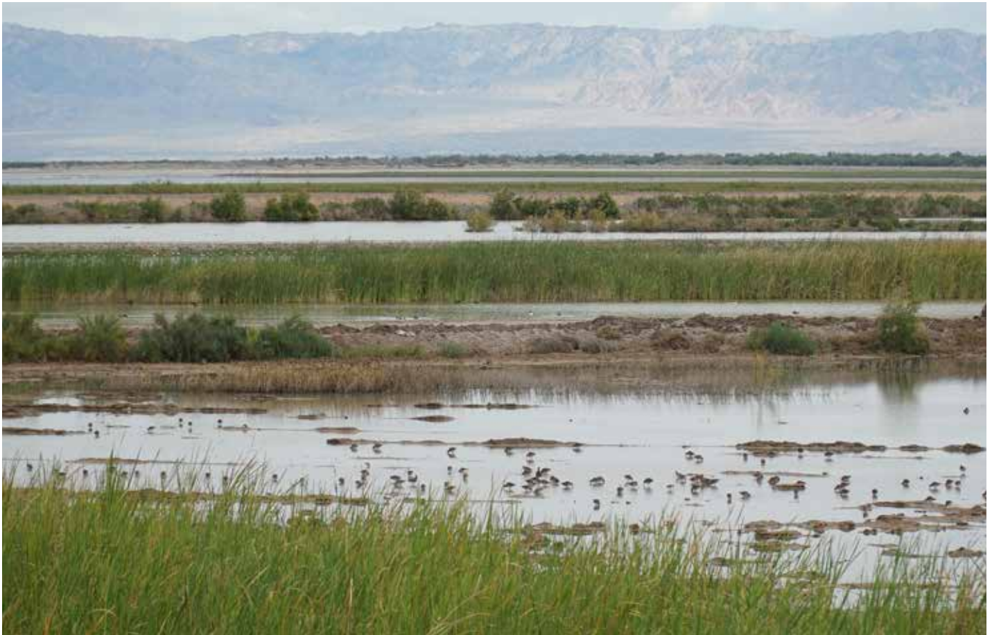
WETLANDS in Unit 2 of the Sonny Bono Salton Sea National Wildlife Refuge. Jonathan Nye

Without significant freshwater introduction to the Salton Sea, the ecosystem faces collapse due to excessive nutrients, rising salinity, and declining water levels.