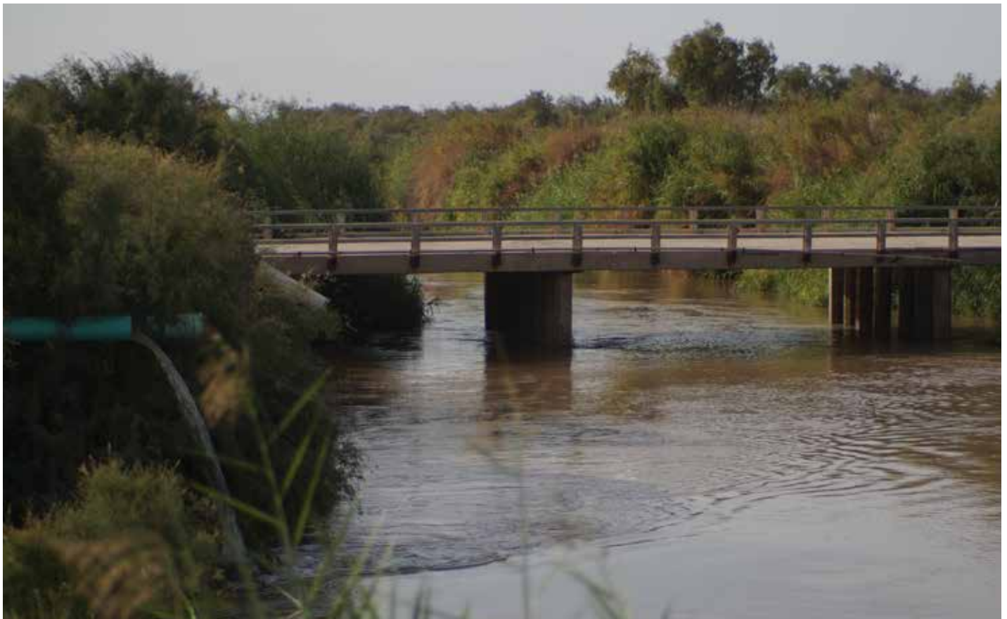
AGRICULTURAL DRAINS (left) entering the Alamo River near its terminus at the Salton Sea. Jonathan Nye

The volume of the Salton Sea is a straightforward difference between inflows and outflows. The Sea's only surface outflow is via well-understood rates of evaporation, and surface inflow is estimated from measured flow rates at various rivers and drains. The unknown factor is the dynamics of subsurface water. The model that the Salton Sea Management Program has used to predict lake levels for current management plans assumes constant net groundwater flows into the lake, but the possibility of lake discharge to groundwater is not considered. Accurate predictions of future lake level require new research to properly quantify lake-groundwater interactions.