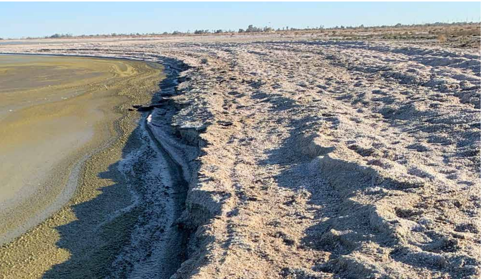
GYPSUM-LADEN SALT CRUST on the exposed lakebed near Desert Shores. Caroline Hung

ticulate matter. A drop in air quality will likely add additional burdens on communities already dealing with disproportionately high levels of ambient particulate matter and related respiratory issues. More work is necessary to fully understand the transport, composition, and health impacts of pollutants originating from the Salton Sea and its increasingly exposed lakebed, and to inform and guide mitigation efforts aimed at improving the health and well-being of local communities.