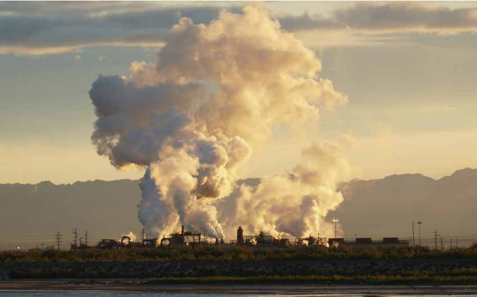
GEOHERMAL POWER PLANT on the southeastern shore operating in the early morning.

Economic opportunities for developing non-traditional mineral and energy resources at the Salton Sea could help offset expected environmental and human health costs.