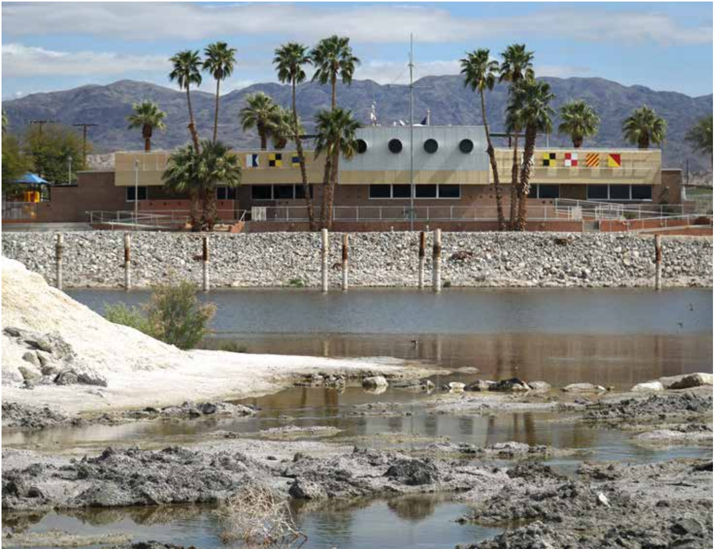
NORTH SHORE YACHT CLUB, originally built along the shoreline, is now high and dry.

poverty, poor access to health care, and chemical exposures from agriculture work further degrade the quality of life, driving additional impacts on mental health in the community. Continued environmental degradation at the Salton Sea accompanied by increased production of dust and other air pollutants has already impaired the economic and social fabric of the region. Health disparities and costs to the community will likely increase unless steps are taken to address the issues raised here.