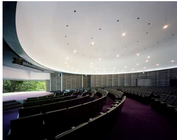
INAMORI Hall, Shiran Kaikan