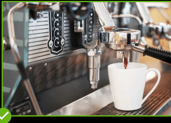
Simple cinemagraphs (.mp4)