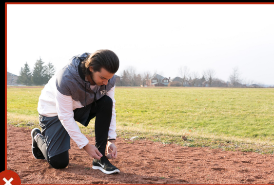
Logos or brands present