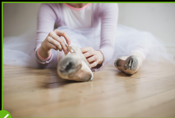
Proper color grading