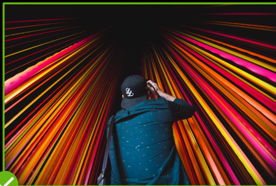
High definition images