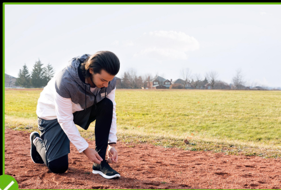
Logos or brands removed