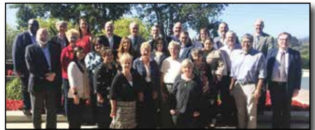
ACS WASC Commissioners at June 2018 Meeting