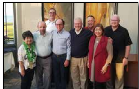
ACS WASC Departing Commissioners