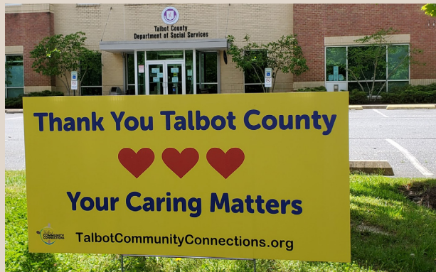
Beginning in June 2020, Talbot Community Connections sold “Thank You Talbot County” yard signs to both express gratitude to the Talbot County community for the support being provided to county residents and to raise funds to support the Talbot County Children’s Advocacy Center and other TCDSS community services.