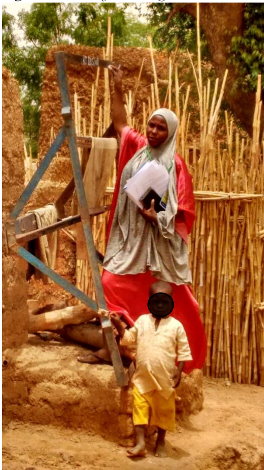
Figure 1: Creatively addressing chalk's limitations