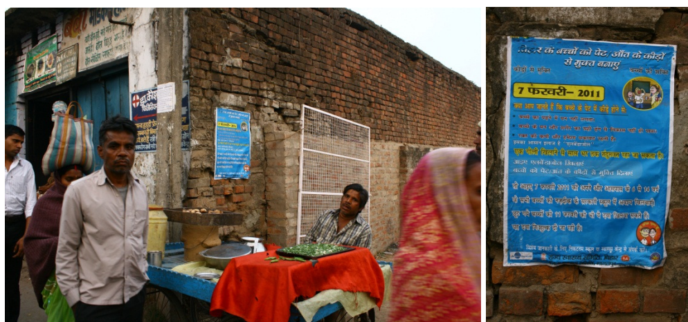
Information, Education and Communication (IEC) Material: Poster at a local food stall