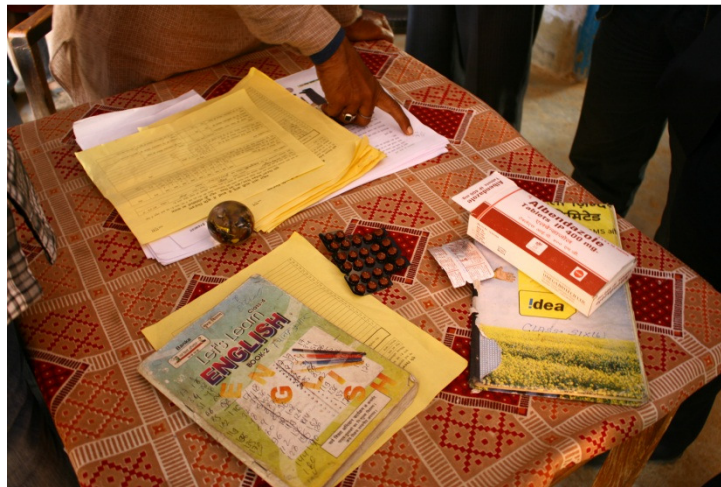
Deworming Day Reporting Forms

To evaluate the program, data to measure program coverage was collected from every school. This school-level data was then aggregated at the block, district and state level to determine overall program coverage. These monitoring reports were analysed and used to strengthen the programme in subsequent phases.