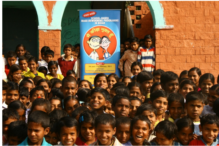
Deworming day at schools

This momentous achievement is directly attributable to the excellent coordination and collaboration between the SHSB, BEPC and key development partners such as DtW. This model of scalable and sustainable school-based deworming now serves as a model of school-based deworming nationwide. In addition, school-based deworming provides an excellent foundation for other school health interventions benefiting all school-age children throughout the state.