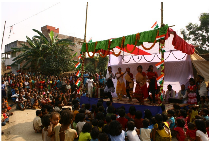
Meena Manch show with the message of school-based deworming

In order to achieve maximum impact across urban and rural areas and reach enrolled and non-enrolled children as well as parents and the community at large, the Public Relations Department (PRD) and BEPC leveraged existing structures such as Shiksha Adhikar Yatra and Meena Manch. The Government of Bihar devised an innovative community sensitisation strategy to reach the masses through radio jingles, street theatre, posters, banners, handbills, newspaper appeals and press conferences.