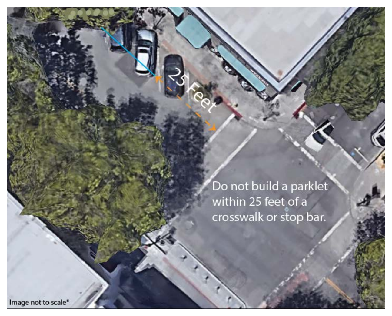
Figure E: Parklet distance from an intersection.