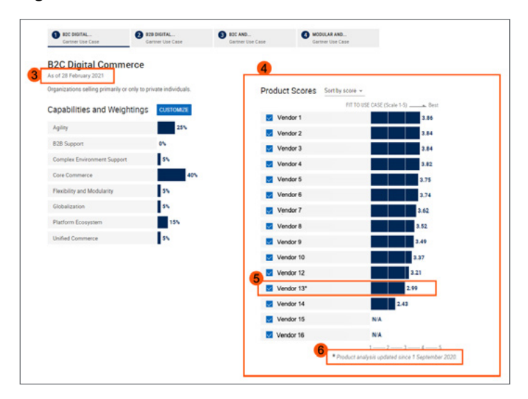
Figure 2. Scorecard View

Updates are also visible in the scorecard view shown in Figure 3: