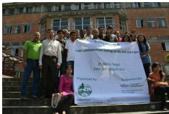
Participants of a Training on Lead Sampling in Nepal

Support OK International by making a tax-deductible contribution at the "Donate" button on our web site. http://www.okinternational.org