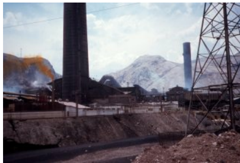
Doe Run Smelter in La Oroya, Peru

The Doe Run Smelter in La Oroya, Peru entered bankruptcy and closed in 2009 after polluting the community for decades. At that time the company was under pressure from the Peruvian Government to complete the required pollution controls under their Program Compliance and Environmental Management (PAMA) agreement. The company's creditors met in January 2012 and decided to restructure rather than liquidate. Doe Run Peru will now have 60 days to submit a restructuring plan, which takes into consideration their environmental obligations. The company will also be required to seek an extension of the PAMA in order to re-open the smelter.