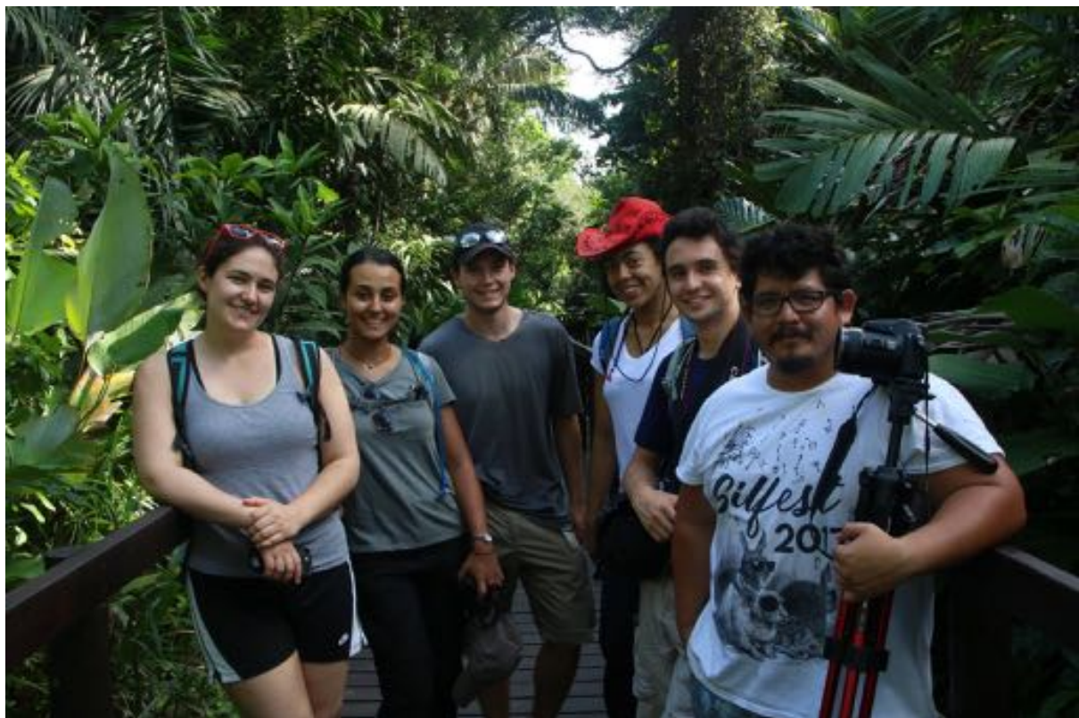
The team during an amazing walk through Cahuita National Park.

We had a final trip across the river to film the last scenes we needed and met two more indigenous farmers. On the drive back we stopped to help a sloth cross the road. We had an hour on the beach in the evening before a team dinner.