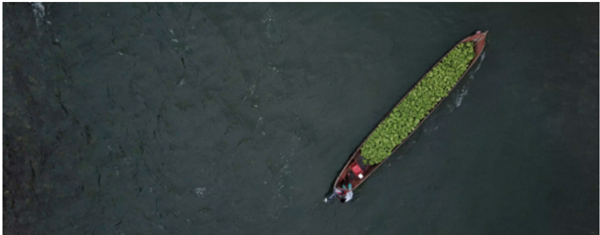
Bananas crossing the river

We went back across the river to complete the filming of the banana transport as they made it down to the river and were ferried across on the same dugout canoe taxi that we'd been taking. We took some amazing footage using the drone of the boat on the river and filmed a final interview with a Trobanex coordinator.