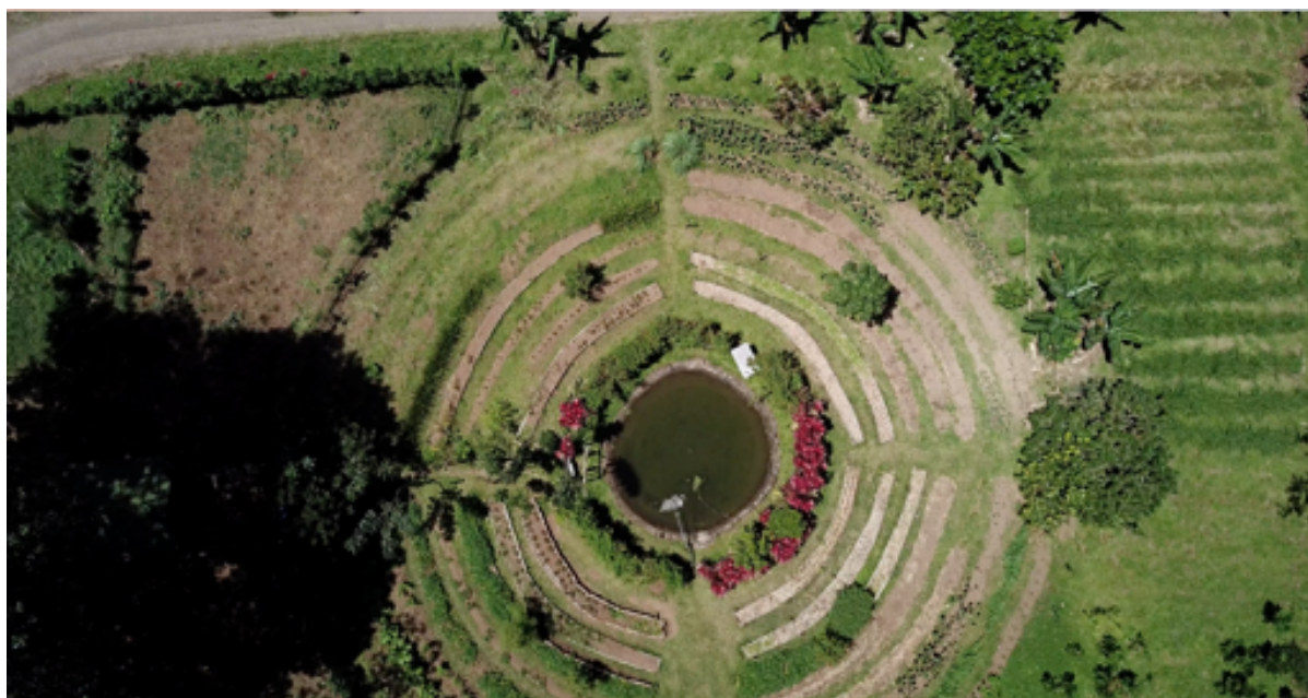
Armando's circular farm

The team were up at 06:00 to meet a class of students studying soil nematodes and root health. We also took the drone out for its first fly and got some amazing footage of the plantations and surrounding forest from above. After lunch we met Armando who runs the campus' agroforestry plot. We walked through his plot as we interviewed him and he told us about his integrated farming, involving co-planting of complementary crops and using chicken and pig manure for fertiliser.