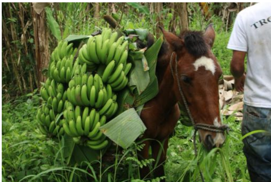
Ready to bring bananas back to the bus.

We returned to the Bri-Bri community to film the process of banana collection by Trobanex, a banana transport company who bring together all the bananas grown in the remote communities and sell them on to larger buyers. We followed a farmer harvesting his bananas and then transporting back several bunches on the back of his horse. Lots of farmers had brought their bananas for collection day so they were weighed and then loaded into the back of an old school bus, which was an amazing sight. After lunch, we filmed a local farmer at his farm and interviewed him about being a small banana producer in a commercial world.