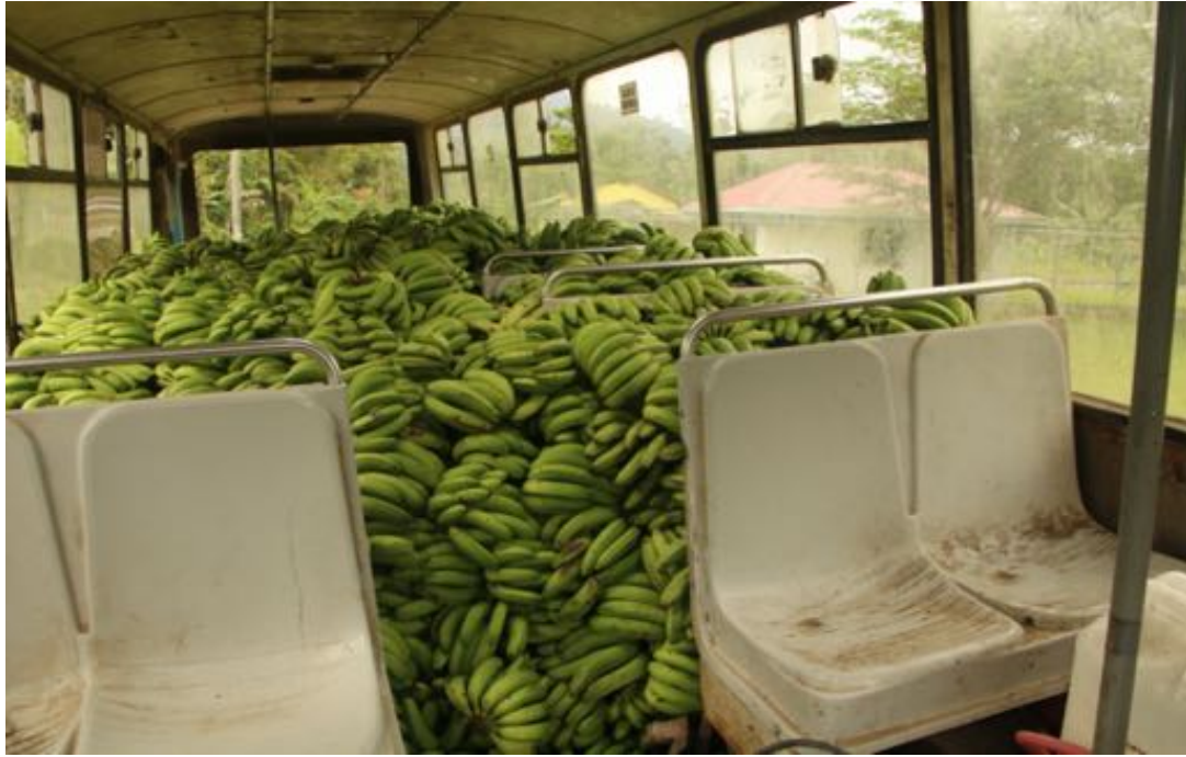
A bus load of bananas.