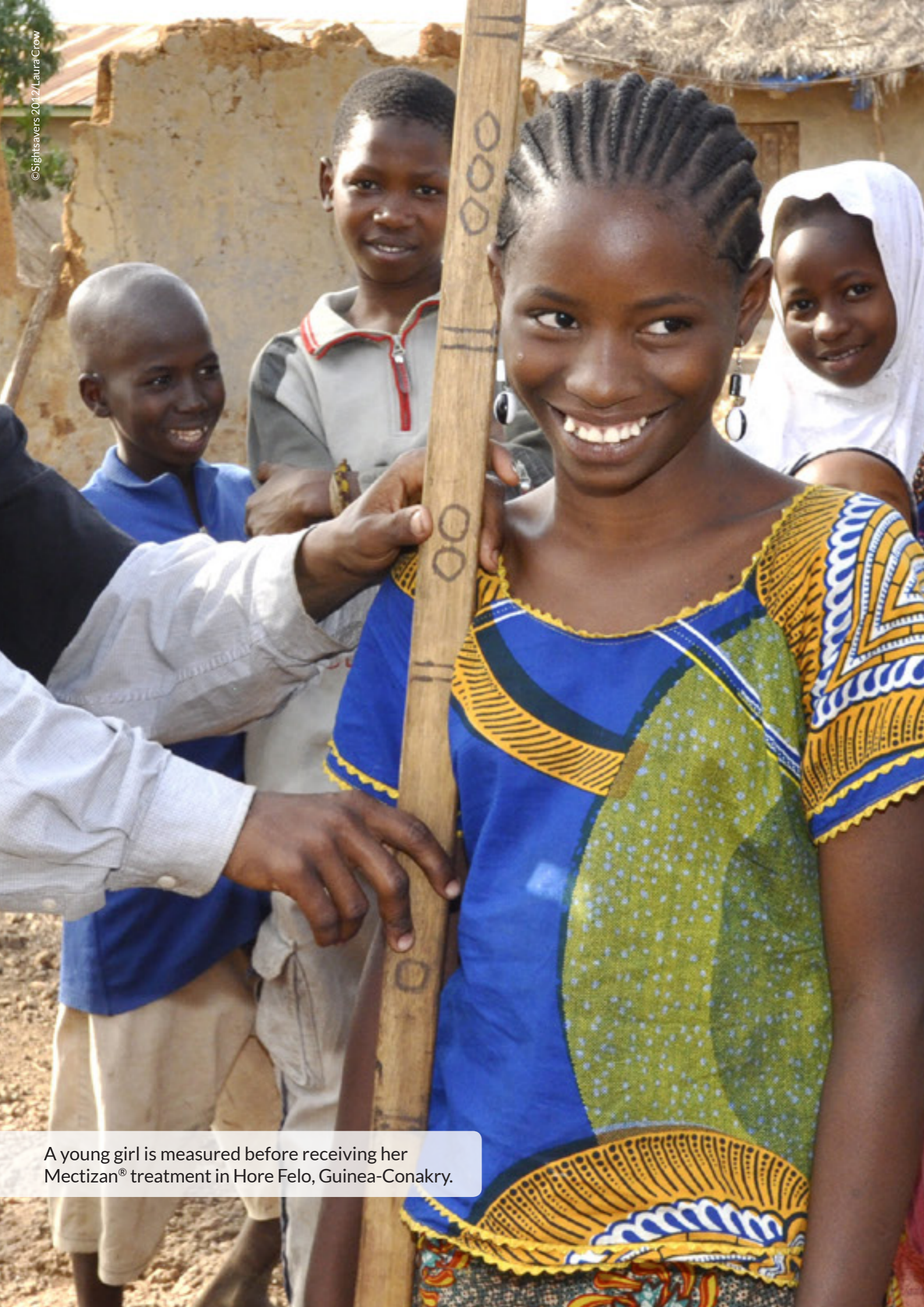
A young girl is measured before receiving her Mectizan® treatment in Hore Felo, Guinea-Conakry.