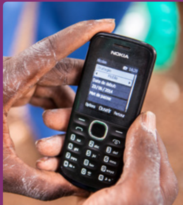
Data reporting by mobile phone in Mali.

By 2017, pilot programs will have scaled, grant-funded countries set up for standardised data collection, and all other country programmes should have a plan in place to incorporate electronic data collection into their work. As these mHealth programmes grow, the mobile data collection systems used in the field will be integrated directly into Sightsavers’ databases, also transforming how annual output statistics are reported and shared.