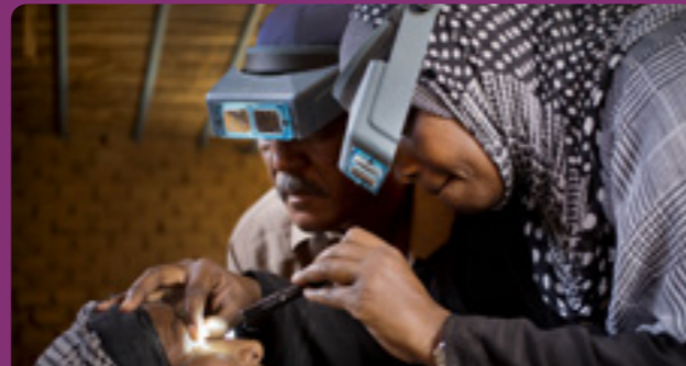
A doctor and grader examine a woman's eyes for trachoma in a village near Khartoum, Sudan during the GTMP.

The GTMP team worked with ministries of health and NGO partners to: develop sampling protocols and plans/budgets; provide training materials, processes and expert resource to support 'training of trainers' and 'training of grader and recorder' workshops; process, clean and provide technical oversight (supported by WHO) and provide troubleshooting and support during the mapping and collection of over 60 million data items. The GTMP team also developed automated systems to support the ministries of health to review and approve their data and results.