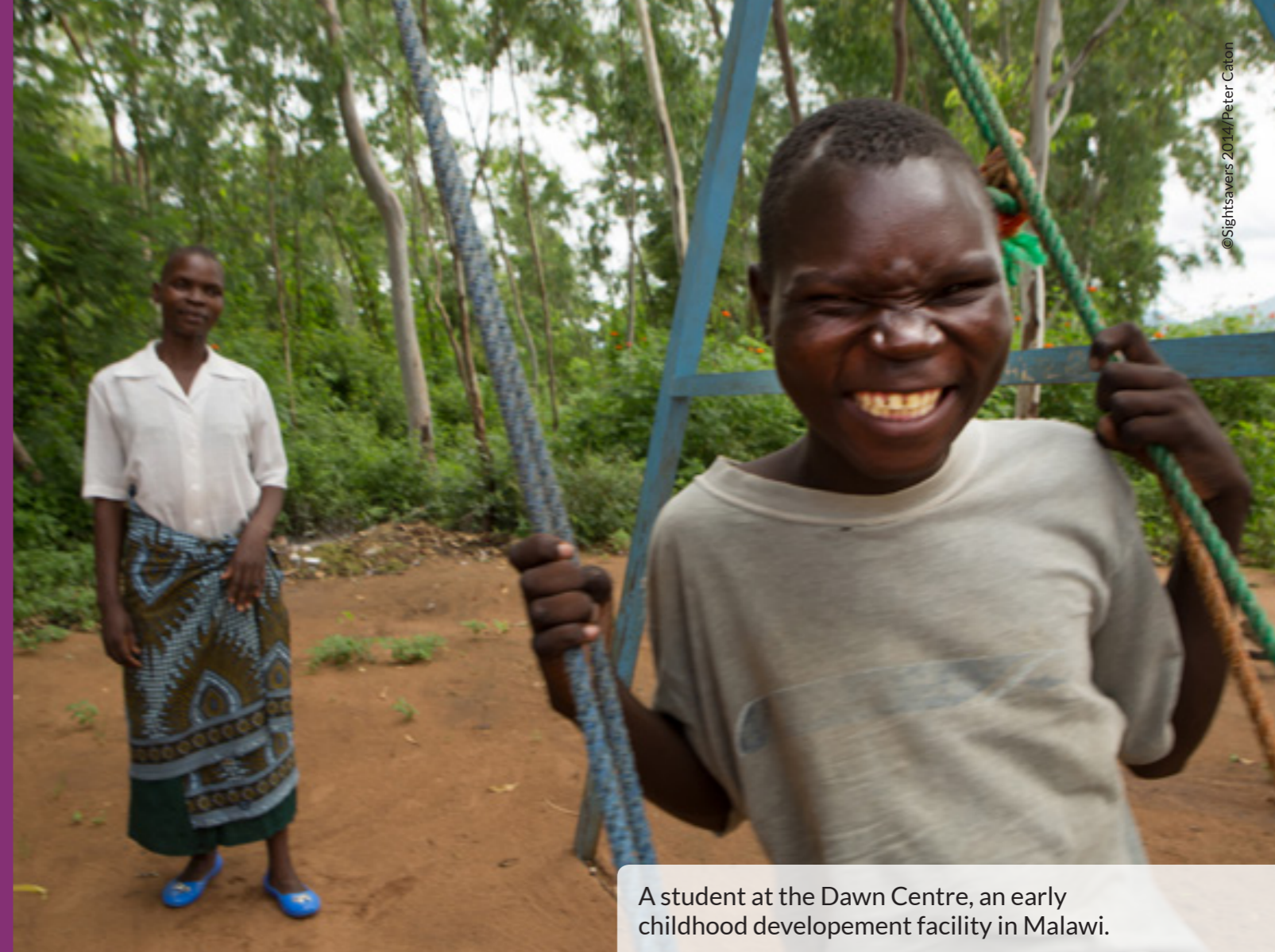
A student at the Dawn Centre, an early childhood development facility in Malawi.

It is also uncontroversial to manage the painful and debilitating symptoms of diseases such as LF and buruli ulcer, to conduct surgeries where necessary (and where patients elect to undergo) and to provide preventive chemotherapy for trachoma, onchocerciasis and schistosomiasis.