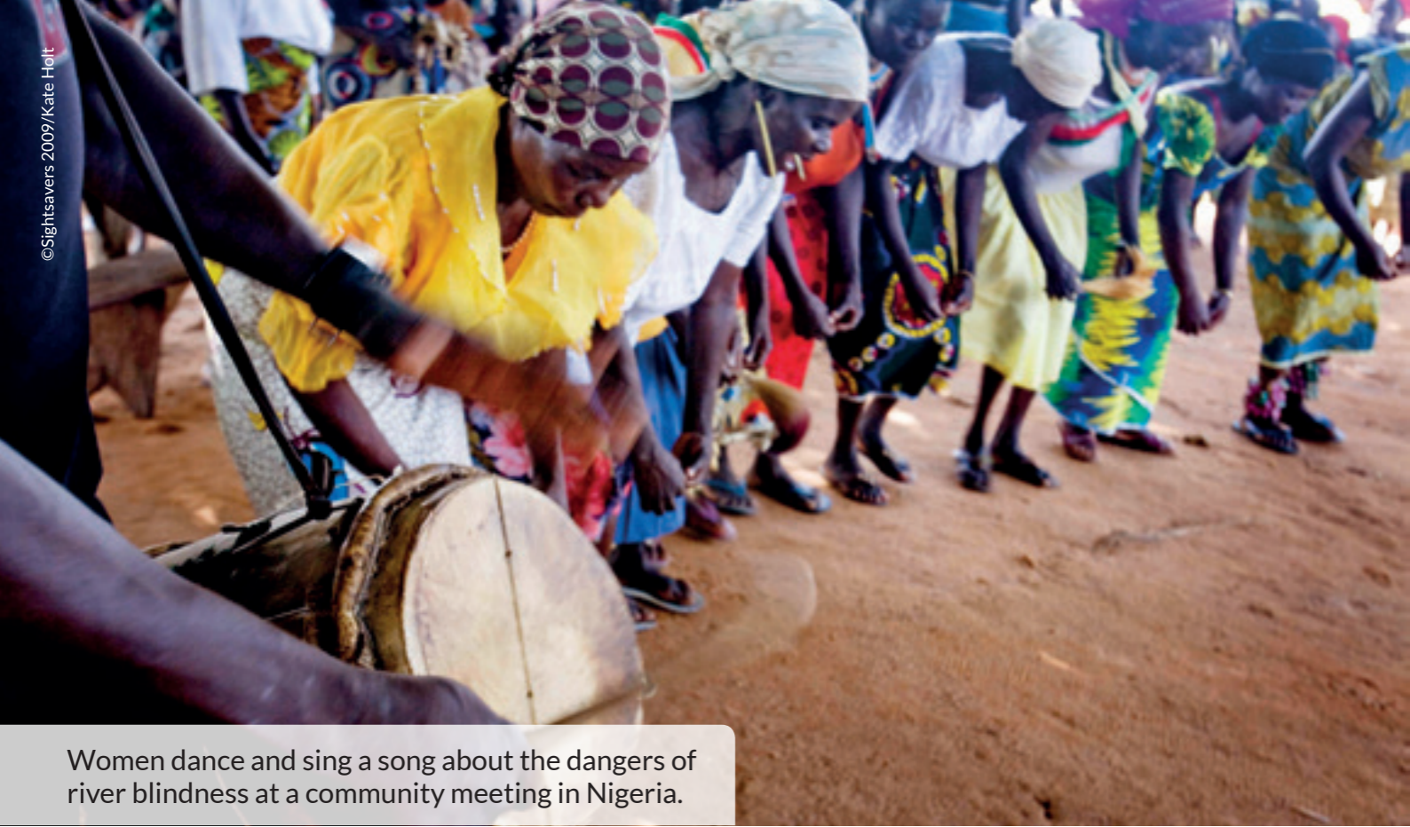
Women dance and sing a song about the dangers of river blindness at a community meeting in Nigeria.