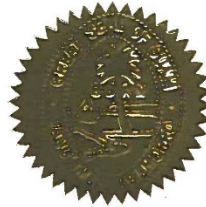
JOSHUA F. TENORIO Sigundo Maga'låhen Guåhan Lt. Governor of Guam