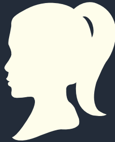
MOTHER'S MAIDEN NAME