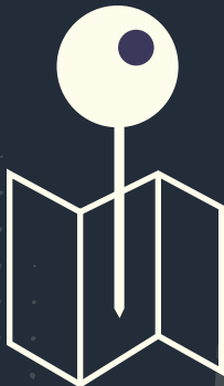
PLACE OF BIRTH