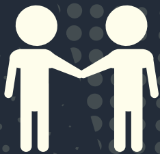
NAME OF PARENTS