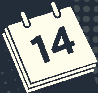
DATE OF BIRTH