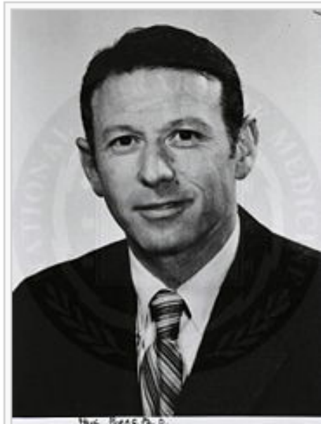
Paul Berg, a leading researcher in the field of recombinant DNA technology who subsequently shared the 1980 Nobel Prize in Chemistry with Walter Gilbert and Frederick Sanger .

The repercussions of these actions are still being felt through the biotechnology industry and the participation of the general public in scientific discourse. [3] Due to potential safety hazards, scientists worldwide had halted experiments using recombinant DNA technology, which entailed combining DNAs from different organisms [2][3] . After the establishment of the guidelines during the conference, scientists continued with their research, which increased fundamental knowledge about biology and the public's interest in biomedical research . [4]