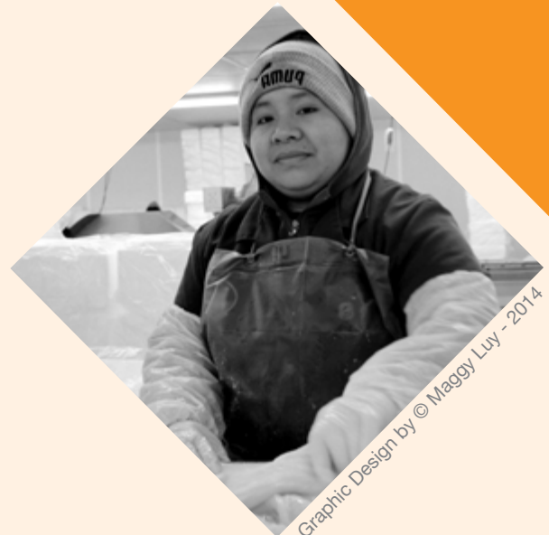
Graphic Design by © Maggy Luy - 2014