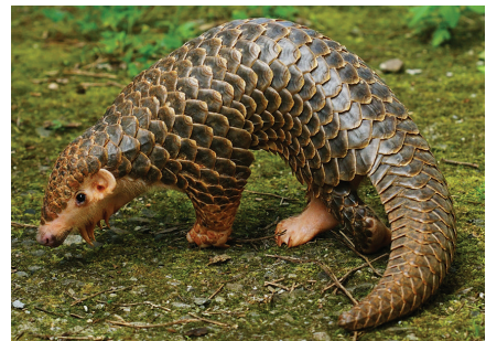
Figure. Covered in tough keratin scales interspersed with strands of fur, the pangolin, also known as a scaly anteater, assumes an impenetrable rolled-up position when threatened. Note the short muscular forelimbs. Pangolins are endangered and World Pangolin Day is the third Saturday in February. Photo of a young Chinese pangolin ( Manis pentadactyla ) by Te-Chuan Chan (Taipei Zoo, Taiwan) and Wen-Ta Li (Pangolin International Biomedical Consultant Ltd., Taiwan)

Linnaeus named the genus Manis , derived from manes , Latin for “spirits” or “ghosts or shades of the dead,” which refers to their noncuddly reptilian persona and solitary nocturnal foraging. Covered by keratin scales, pangolins, when threatened, assume a rolled up position, described by the Malay word pengguling (one who rolls up). Native to Java (thus javanica ), their habitat includes Southeast Asia, especially the Indomalayan archipelago and Sunda Islands. Humans hunt pangolins for their meat, consume their blood as an elixir, and use their scales and other body parts as ingredients for crafting leather products and nonefficacious medications.