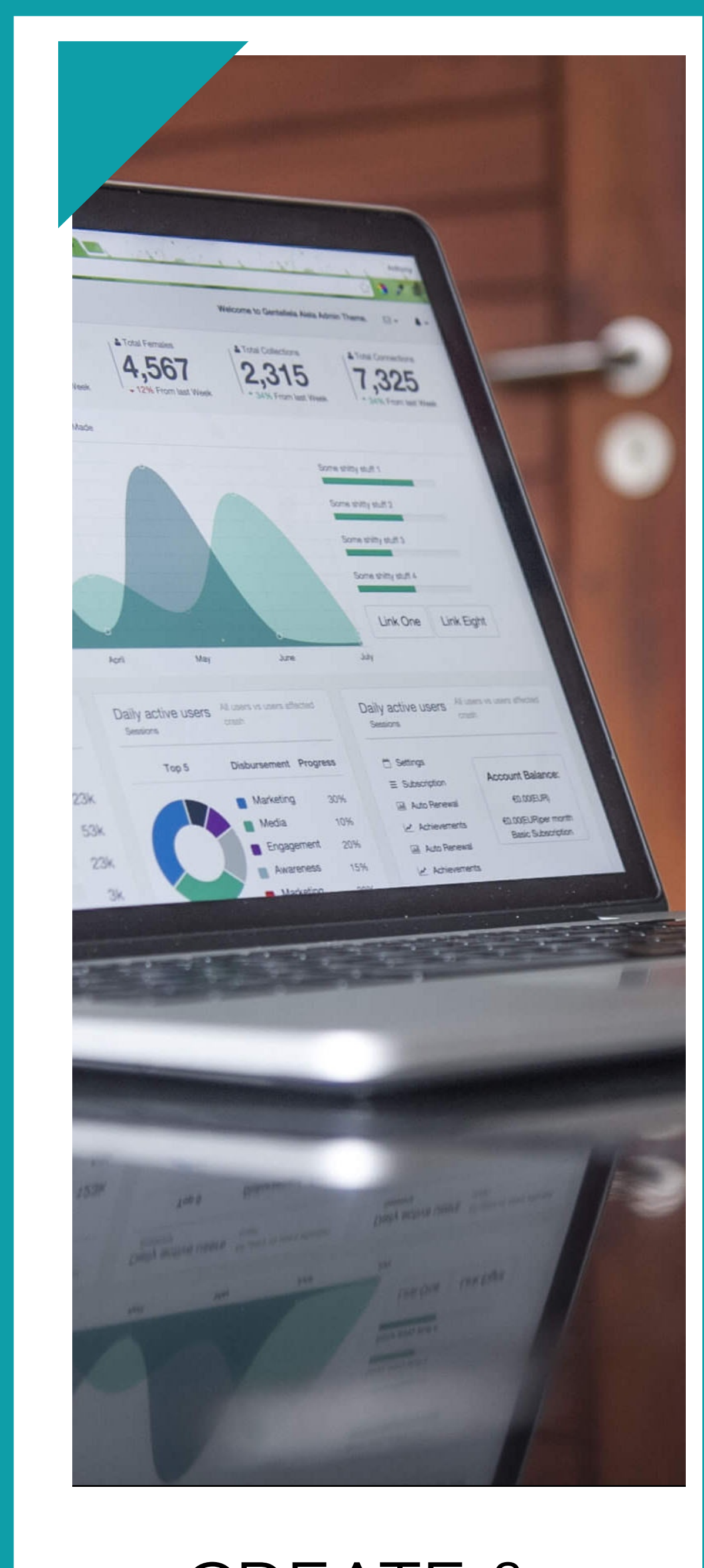
CREATE & IMPROVE DATA MONITORING SYSTEMS