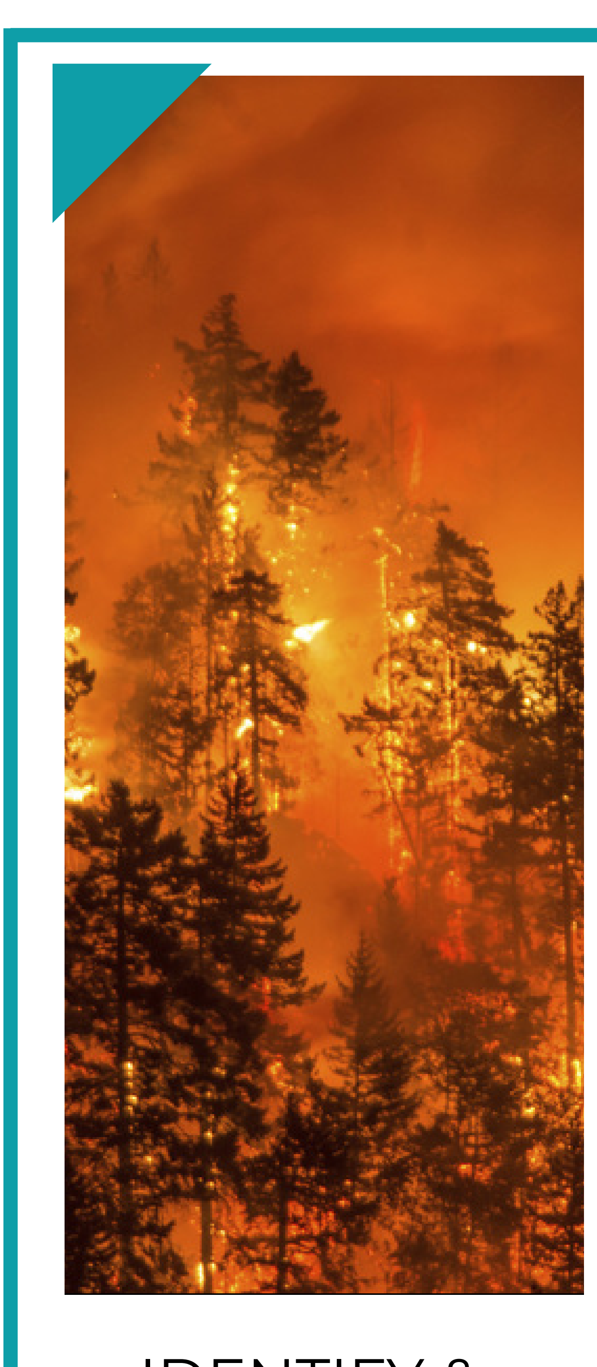
IDENTIFY & PREVENT ENVIRONMENTAL HEALTH HAZARDS