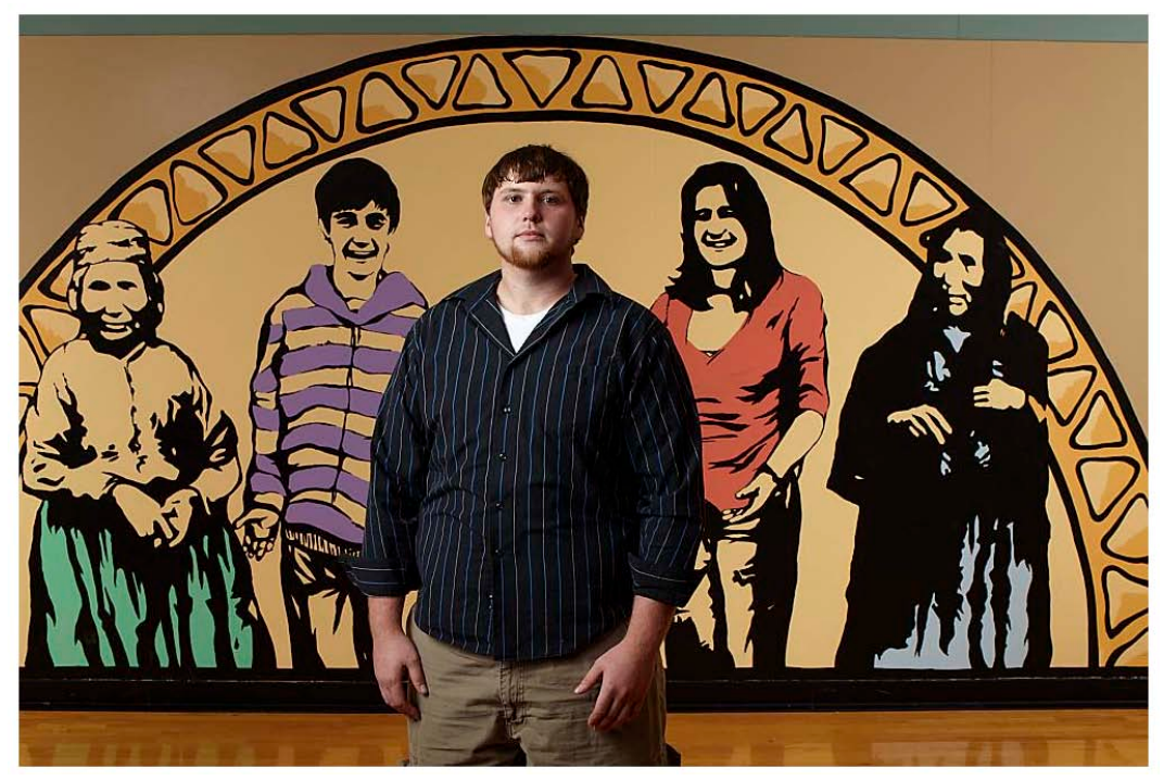
Coquille & Coos Bay Tribes