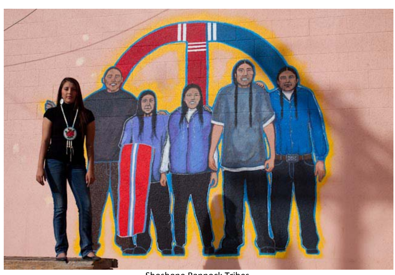
Shoshone Bannock Tribes