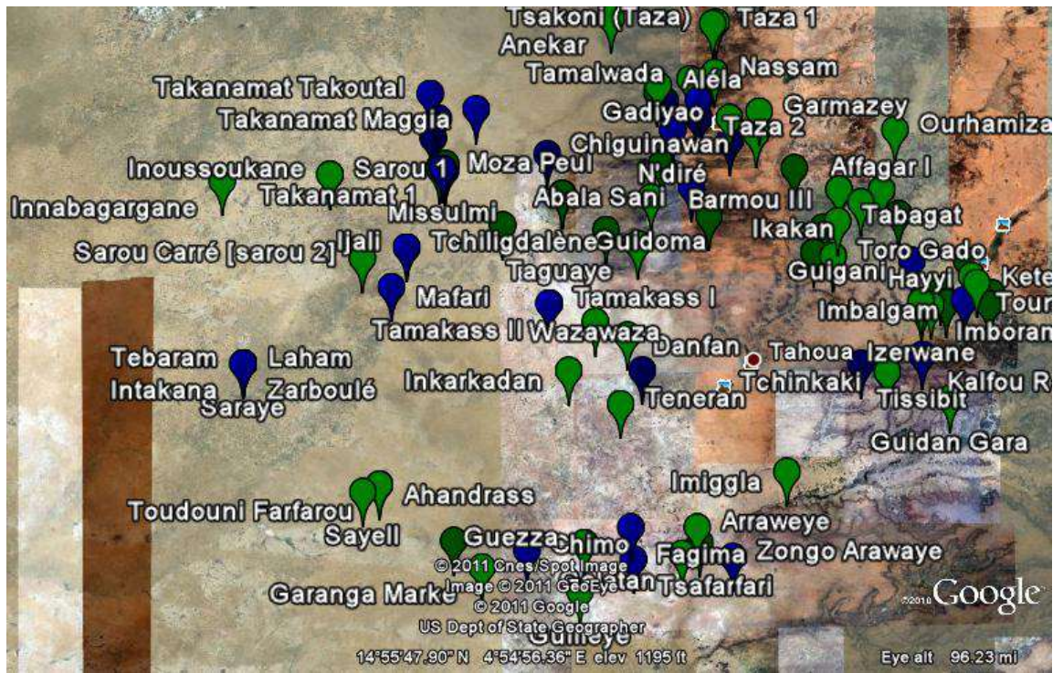
Figure 1. Map of Villages in the Project Area