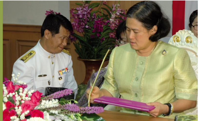
The Thai National IDD Control Board was presided over by Her Royal Highness the Princess Maha Chakri Sirindhorn

including the Ministry of Interior, Ministry of Industry, Ministry of Commerce, Ministry of Education, the President of Iodized Salt Producers Association, the Thai Red-Cross, UNICEF, WHO, ICCIDD, the Dean of the Faculty of Medicine, Mahidol University, the Office of National Economic and Social Development Board, the Bureau of the Budget, and the Government Pharmaceutical Organization.