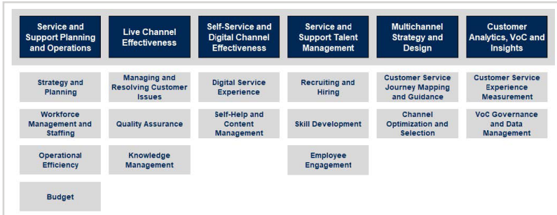
Illustrative map of the focus areas and functional activities used to assess functional maturity