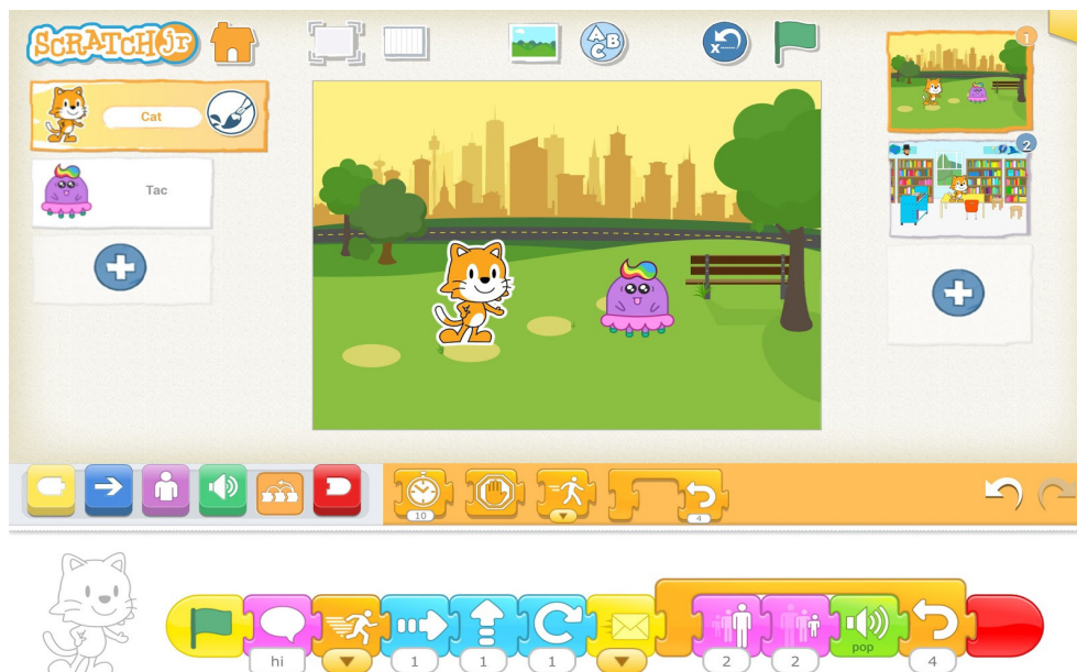
Figure 3. ScratchJr interface

are learning to read. Finally, both languages introduce children to core computational concepts of sequencing, repeat loops, and conditional statements.