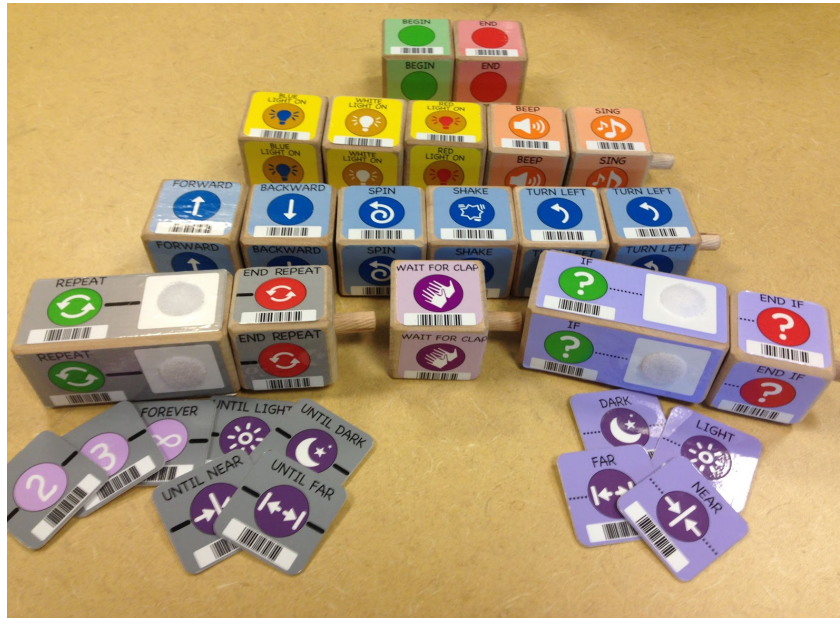
Figure 2. KIBO's programming language

KIBO's programming language is composed of over 18 individual wooden programming blocks (see Figure 2). Some of these blocks represent simple motions for the KIBO robot, such as move Forward, Backward, Spin, and Shake. Other blocks represent complex programming concepts such as Repeat Loops and Conditional "If" statements.