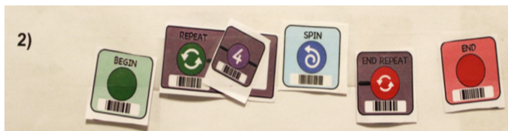
Figure 4. Sample child-completed wheels on the Bus Solve-It

During the assessment, participants completed two different types of tasks. First, children completed a series of tasks called the “Solve-Its” which involved listening to three different stories or songs being read or sang aloud by a researcher. After listening to the story or song, and the Solve-Its prompt children to arrange paper blocks into a sequential program that matched what they heard. The Solve-It tasks were developed by to target areas of foundational programming ability and basic sequencing skills (Strawhacker & Bers, 2015; Strawhacker, Sullivan, & Bers, 2014).