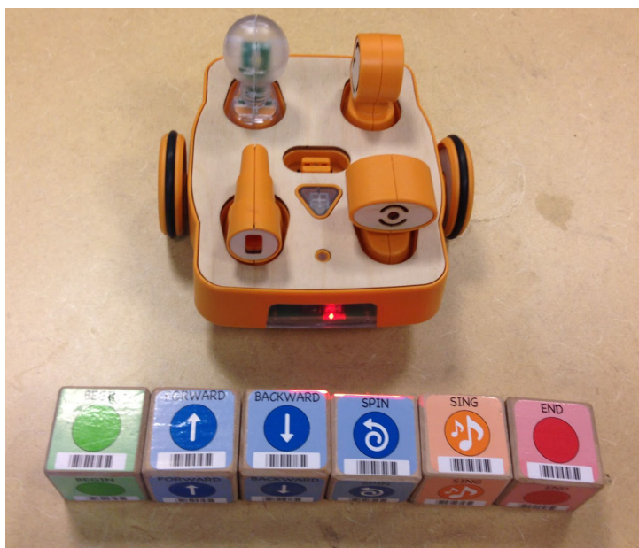
Figure 1. The KIBO robot

KIBO was chosen to represent a tangible programming technology because it is programmed without any screen time from tablets or computers. Children create a sequence of instructions (i.e., a program) using interlocking wooden programming blocks that represent different actions for KIBO to carry out. KIBO uses an embedded scanner to read the barcode on each programming block, and the completed program can be run with the pressing of a button. Prior research has shown that children in pre-kindergarten through second grade can learn engineering and programming concepts with KIBO (Elkin et al., 2016; Sullivan, Elkin, & Bers, 2015).