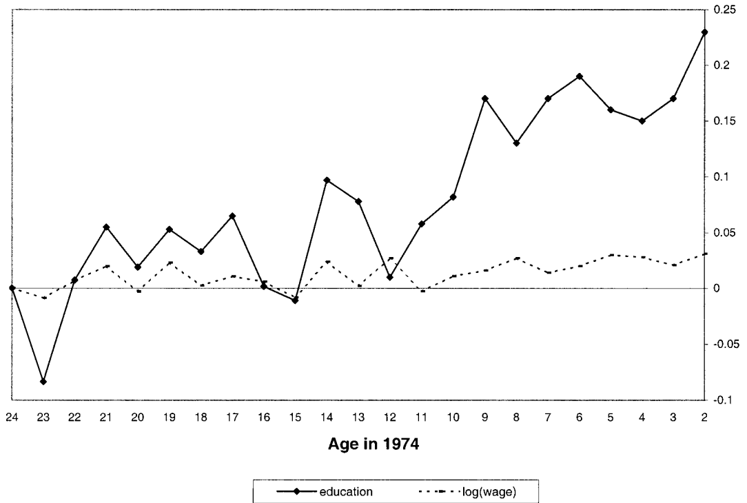
FIGURE 3. COEFFICIENTS OF THE INTERACTIONS AGE IN 1974* PROGRAM INTENSITY IN THE REGION OF BIRTH IN THE WAGE AND EDUCATION EQUATIONS

with valid wage data. Thus, on average, the program caused a 3 to 7 percent increase in the wages of this cohort.