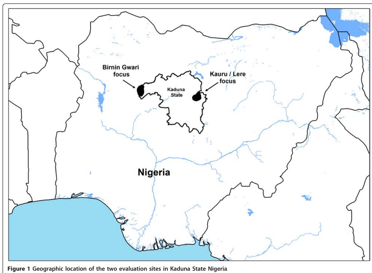
Figure 1 Geographic location of the two evaluation sites in Kaduna State Nigeria.

are located along the rivers of Mairiga and Kwingi in Birnin Gwari and Galma and Karami in Kauru and Lere. The two foci were selected for the following reasons: i) communities in these foci had pre-control epidemiological data; among the areas where large-scale ivermectin treatment was first introduced in Africa were these two foci in Kaduna in which treatment of a sample of the population started as part of a randomised controlled trial of ivermectin in 1988 and 1989, and where skin-snip surveys had been done in preparation for the trial [6,17]. ii) the foci included hyper-endemic villages, i.e. villages with a prevalence of microfilaridermia > 60% [15-17]; iii) the area was located along a river with known breeding sites of Simulium damnosum s.l. , iv) the communities had had 15 - 17 years of annual treatment with ivermectin using the community-based programme since 1991, and subsequently through the community-directed treatment with ivermectin (CDTI) strategy from 1997 with more than 65% treatment coverage.