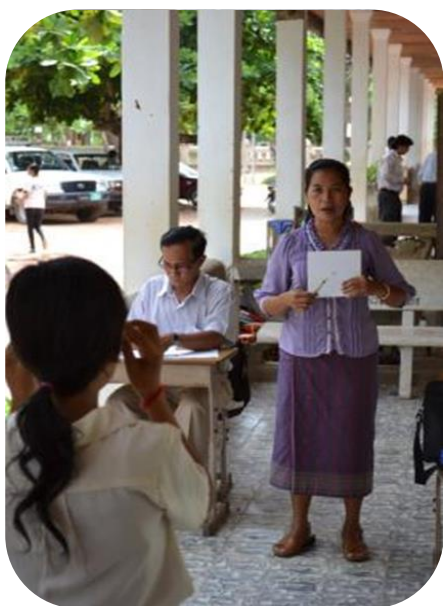
A school girl receiving a visual acuity test by a teacher in Cambodia.