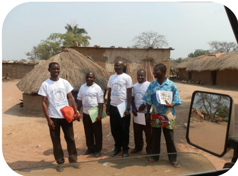
Volunteer Community Drug Distributors in Katanga Sud region