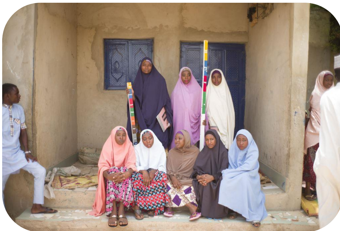
Volunteer community drug distributors in Zamfara state, Nigeria. May 2016.

The control and elimination of NTDs in Nigeria will have significant impact on global disease prevalence given that one in five Africans are Nigerian. It is estimated that 27 million Nigerians need protection from river blindness, 22 million people are already infected with LF, 27 million need protection from trachoma, 26 million need protection from soil transmitted helminths (STH) and 42 million need protection from schistosomiasis.