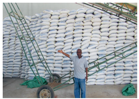
A modern government and privately owned salt iodization factory and bagging plant in Afdera with capacity of producing 60,000 MT tons/year.