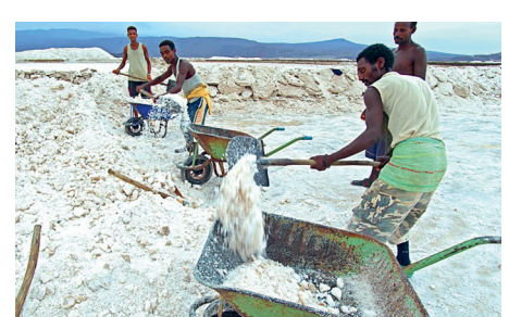
Salt production at Lake Afrera.

As a result of the interruption of the supply of iodized from Eritria, there was a rapid deterioration in the iodine status of the population. For example, the National Micronutrient Survey conducted in 2005 showed alarmingly high total goiter rates of 40% and 35.8% among school-age child-