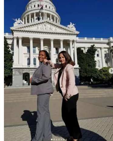
Survivors, family members & professionals provided testimony

AB 1893: Maternal Mental Health Federal Funding