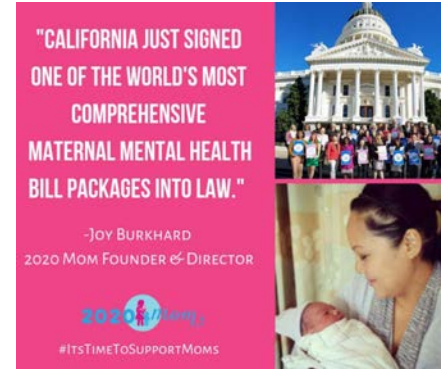
CA's first maternal mental health bill package was signed into law