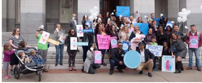
A rally on the Capitol's steps secured authors for all 3 bills

ACR 148 established a task force on the status of maternal mental health care.