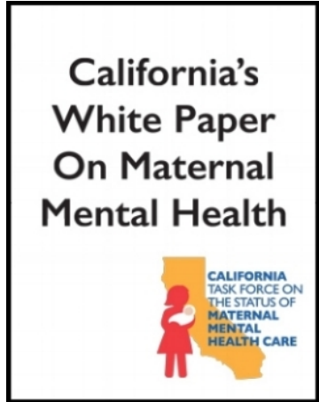
Task Force published California's Strategic Plan: A catalyst for shifting statewide systems to improve care across California and beyond