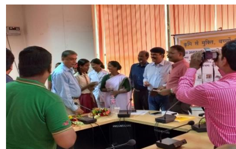
State launch. Ranchi

Policy Advocacy: Program of such scale requires stakeholder convergence and collaborative efforts at each administrative and implementation level, which is imperative for successful implementation of the NDD. The Department of Health, Government of Jharkhand undertook the below mentioned initiatives to engage stakeholders for implementation of NDD Aug 2016.