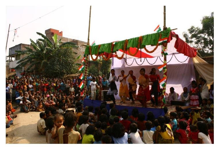
Meena Manch show with the message of school-based deworming

In order to achieve maximum impact across urban and rural areas and reach enrolled and non-enrolled children as well as parents and the community at large, the Public Relations Department (PRD) and BEPC leveraged existing structures such as Shiksha Adhikar Yatra and Meena Manch. The Government of Bihar devised an innovative community sensitisation strategy to reach the masses through radio jingles, street theatre, posters, banners, handbills, newspaper appeals and press conferences.