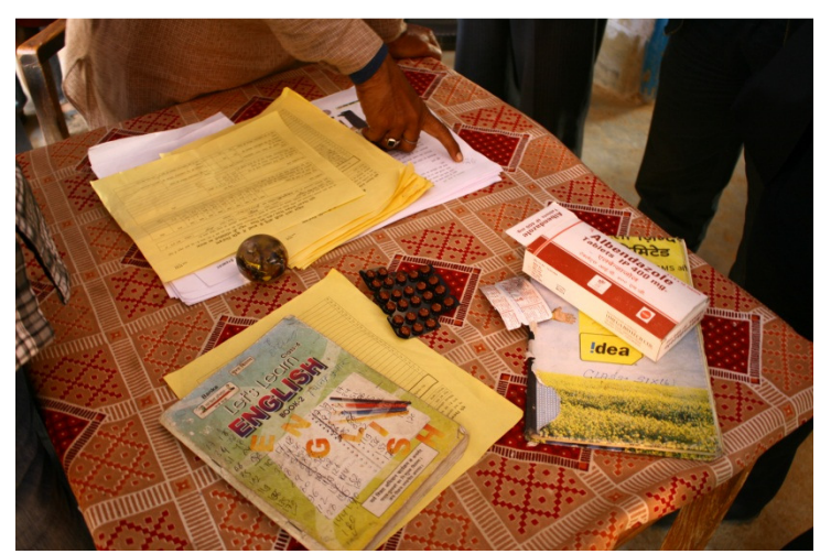
Deworming Day Reporting Forms

To evaluate the program, data to measure program coverage was collected from every school. This school-level data was then aggregated at the block, district and state level to determine overall program coverage. These monitoring reports were analysed and used to strengthen the programme in subsequent phases.