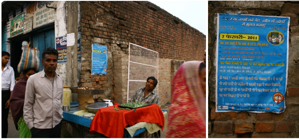
Information, Education and Communication (IEC) Material: Poster at a local food stall