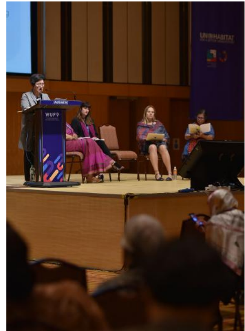
Women's Assembly during WUF9

Local and regional governments are pioneers in highlighting the role of culture in sustainable urban development. Cities are constantly innovating to become more inclusive and offer opportunities for all. This World Assembly will highlight examples and new ideas on how global agendas are supporting local governments to deliver better and create spaces for social inclusion and prosperity.