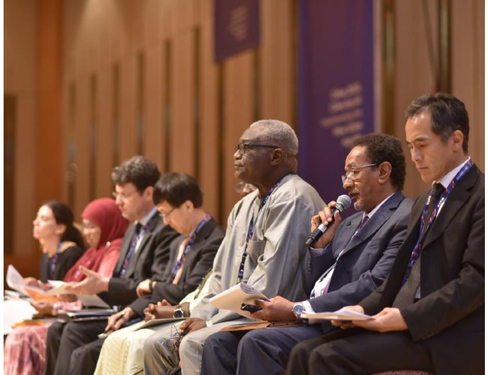
Special Session during WUF9

The objective of the session is to promote community outreach in any planning process with the goal of supporting increased liveability and “cities for all”.