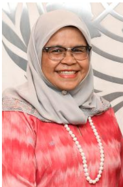
Maimunah Mohd Sharif

Executive Director of the United Nations Human Settlements Programme (UN-Habitat)