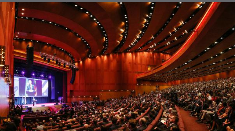
WUF9 Official Opening Ceremony