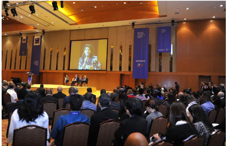
Ministers Roundtable during WUF9

The Roundtable Professionals will present, discuss and debate with the attendees the state of the art of urbanization processes, culture and innovation, including interaction with UN-Habitat. It will include two keynotes on acceleration of urban innovation, mobility and sustainable urban communities, as well as demonstrating innovative autonomous vehicles initiative. A Roundtable discussion with other representatives of HPF members will further discuss the questions of urbanization, innovation and capacity-building, focusing on tradition and forward-looking planning, including a stronger implementation of the SDGs and NUA agenda.