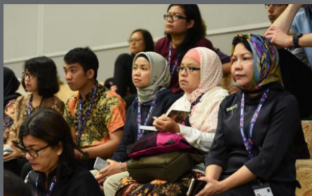
WUF9 Participants