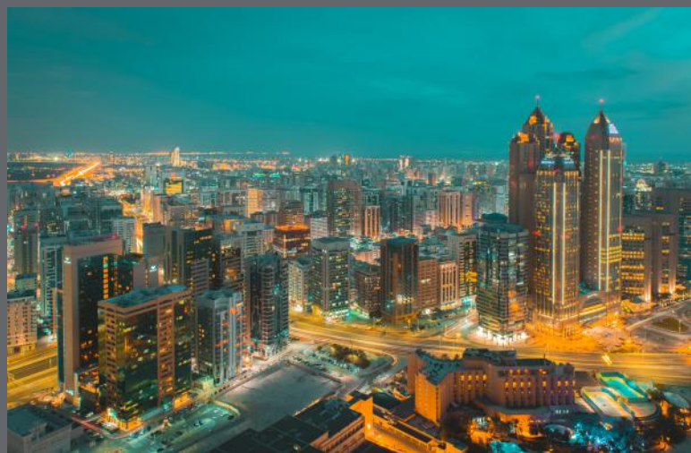
Abu Dhabi