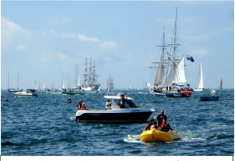
Chaos at the river mouth, where tall ships waited for the race to start.

That evening we were free to explore the festival, and after dark we all watched over the harbour to mark the end of the festival. The next morning was clear and sunny again - this is a big deal in Ireland, so everyone was talking about it - and all the ships were preparing to leave dock for the parade of sail down the river to ocean, where the race would start in the afternoon. It was absolutely breathtaking to see so many ships together, slowly moving past the towns in the Irish countryside along the river, with people waving from the rocky shore the whole way. As we got nearer to the ocean, the class A ships were able to spread a lot