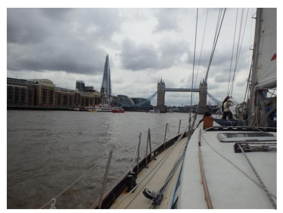
Trip 2; Tacking up the Thames

Sailing up the estuary was unlike anything I'd ever done before. The estuary is riddled with shallow sandbanks, many of which are marked only by wind turbines or WWII era watch towers. Passing by the dark silhouettes of these huge structures in the absolute silence of a ship under sail can only be described as eerie.