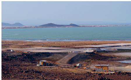
These evaporation ponds are on the southern shore of Lake Afrera, a hypersaline lake in northern Ethiopia. Cinder cones and the Hayli Gubbi volcano are in the background.

As far back as 1988, Ethiopia was one of the first countries in Sub-Saharan Africa that was close to achieving USI, having achieved almost 80% iodized salt coverage, when most iodized salt came from Eritrea. The 1998–2000 war between Ethiopia and Eritrean interrupted Ethiopia's iodized salt supply. As a result, Ethiopia started importing salt from neighboring countries, particularly Djibouti.