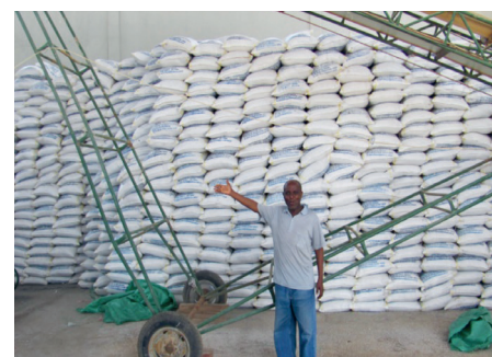
A modern government and privately owned salt iodization factory and bagging plant in Afdera with capacity of producing 60,000 MT tons/year.