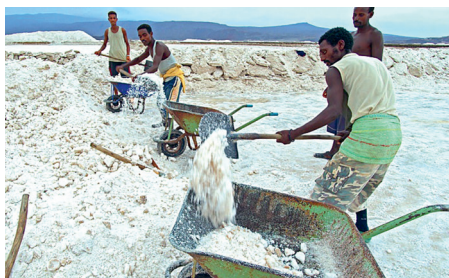
Salt production at Lake Afrera.

As a result of the interruption of the supply of iodized from Eritria, there was a rapid deterioration in the iodine status of the population. For example, the National Micronutrient Survey conducted in 2005 showed alarmingly high total goiter rates of 40% and 35.8% among school-age child-