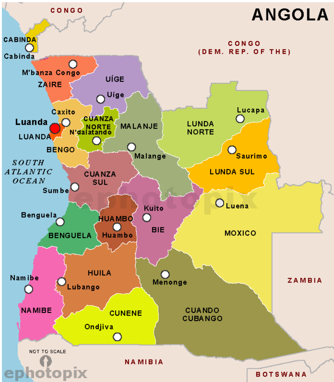
Map 1: Angola, showing provinces and provincial capitals