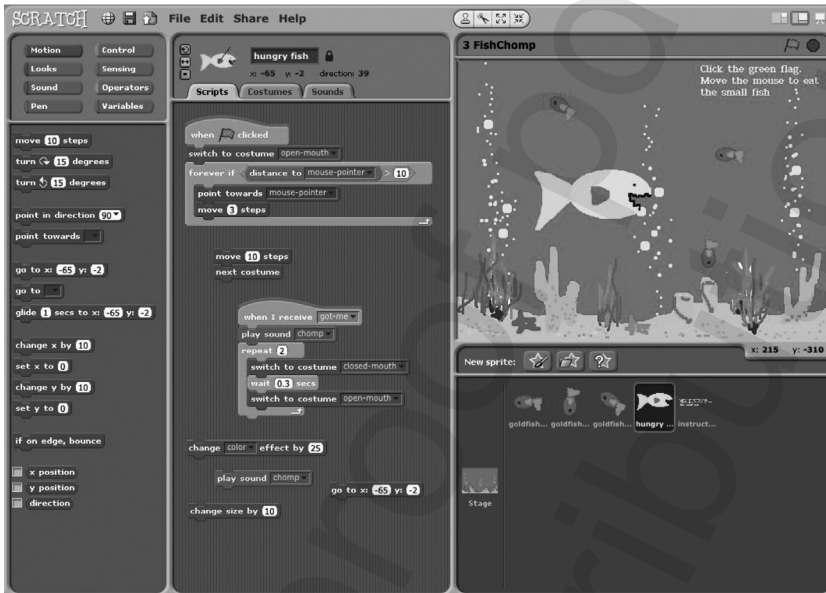
Figure 10.2 Scratch programming interface.