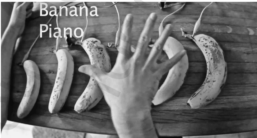
Figure 10.7 Banana piano.