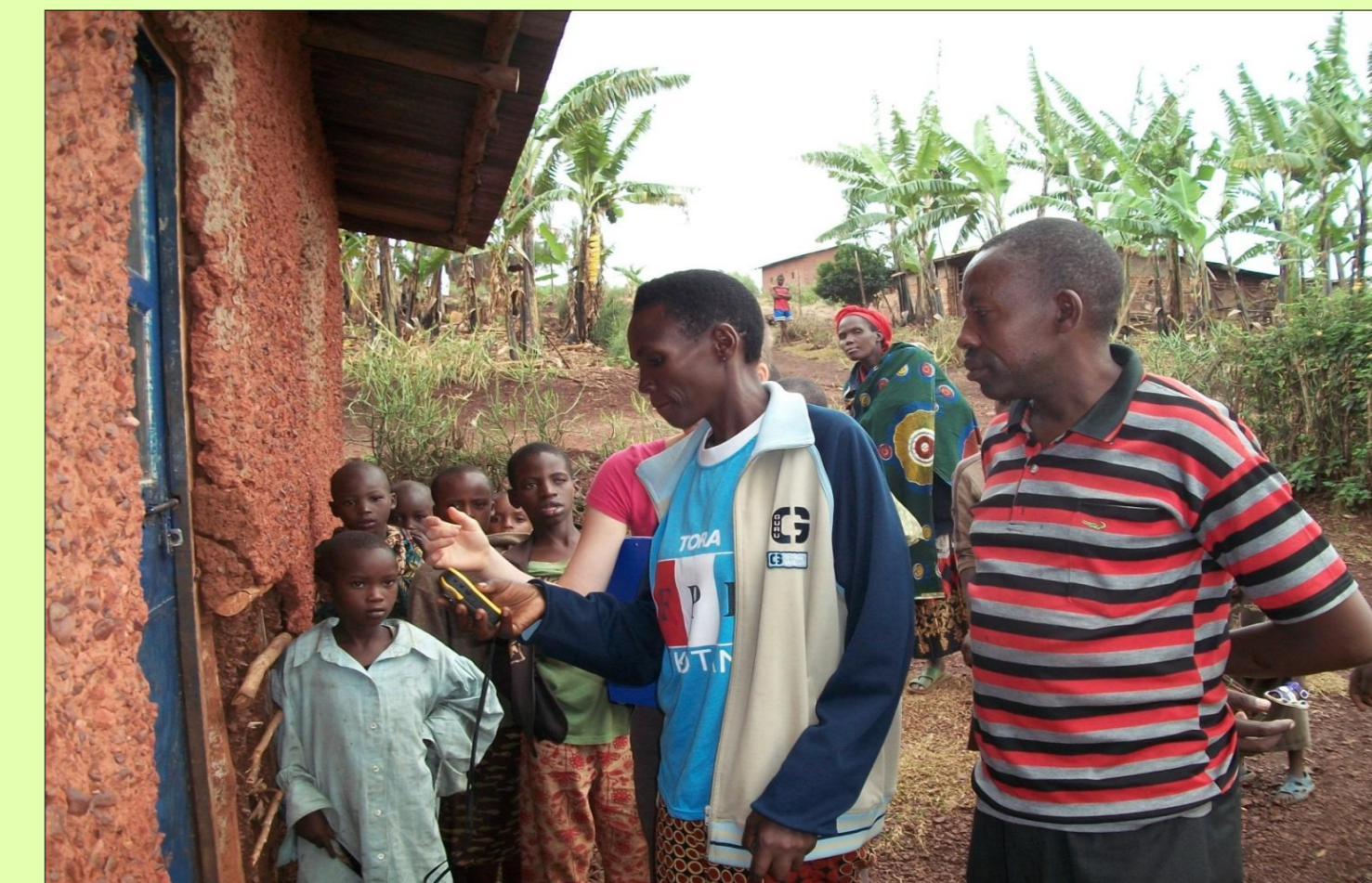
Picture2. CHW collecting GPS waypoint

Geographic Information System (GIS) is a useful tool for improving quality of care for HIV, and improving program monitoring and evaluation. Partners in Health (PIH) supports the Rwanda MoH in providing comprehensive patient care in three districts (Kayonza, Kirehe and Burera), and has introduced GIS technology to map service delivery in the supported catchments.