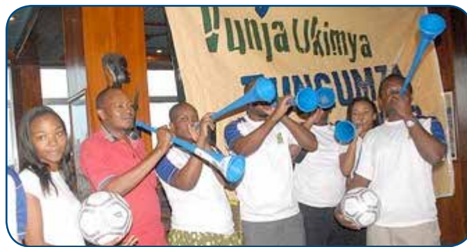
CHAMPION staff and Community Action Team (CAT) members participating in the launch of the Vunja Ukimya World Cup-themed subcampaign.

Phase 3 (the "how to") touched upon the health benefits of effective communication between partners and demonstrated to target audiences how to effectively communicate through examples broadcast in print and electronic media.