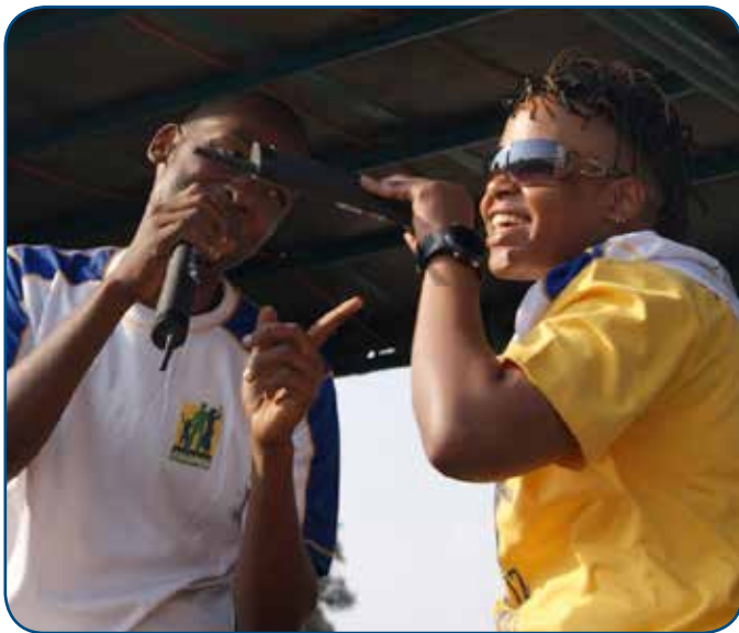
Musical artists performing at a community event to launch the Vunja Ukimwe campaign.