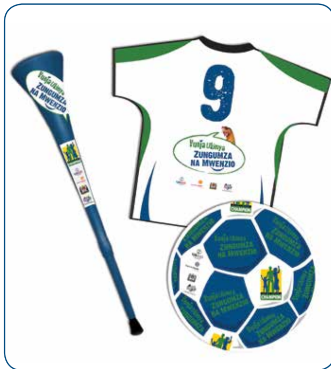
Promotional football jersey, football, and vuvuzela from World Cup-themed subcampaign

Nine in 10 respondents exposed to the campaign reported feeling capable of initiating or strengthening communication with their partner as a result of the campaign. Respondents exposed to the campaign were 1.8 times more likely to report that they would seek RH services jointly with their partner in